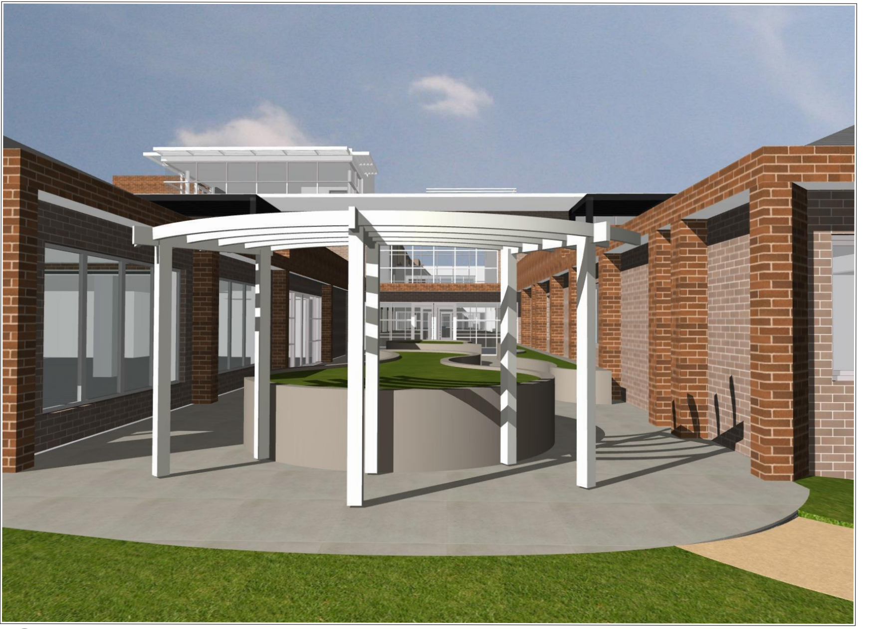
22 SEPT 9 AM - COURTYARD 3